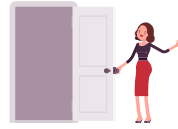
(open/door/5 minutes ago)