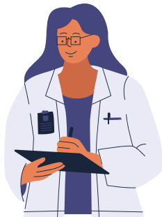
(see/sometime next week)

(1). We use going to-(verb) when we have the _____ to do something before we speak. We have already made a _____ (or a _____) _____ speaking.